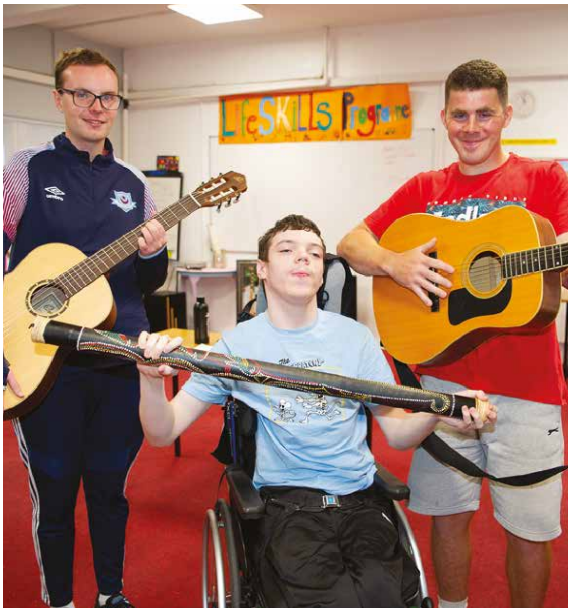
Photo Caption: IWA's School Leaver Service is going from strength to strength. Students in Drogheda show off their new musical skills.

3 new community centres opened in Longford, Balbriggan and Galway.