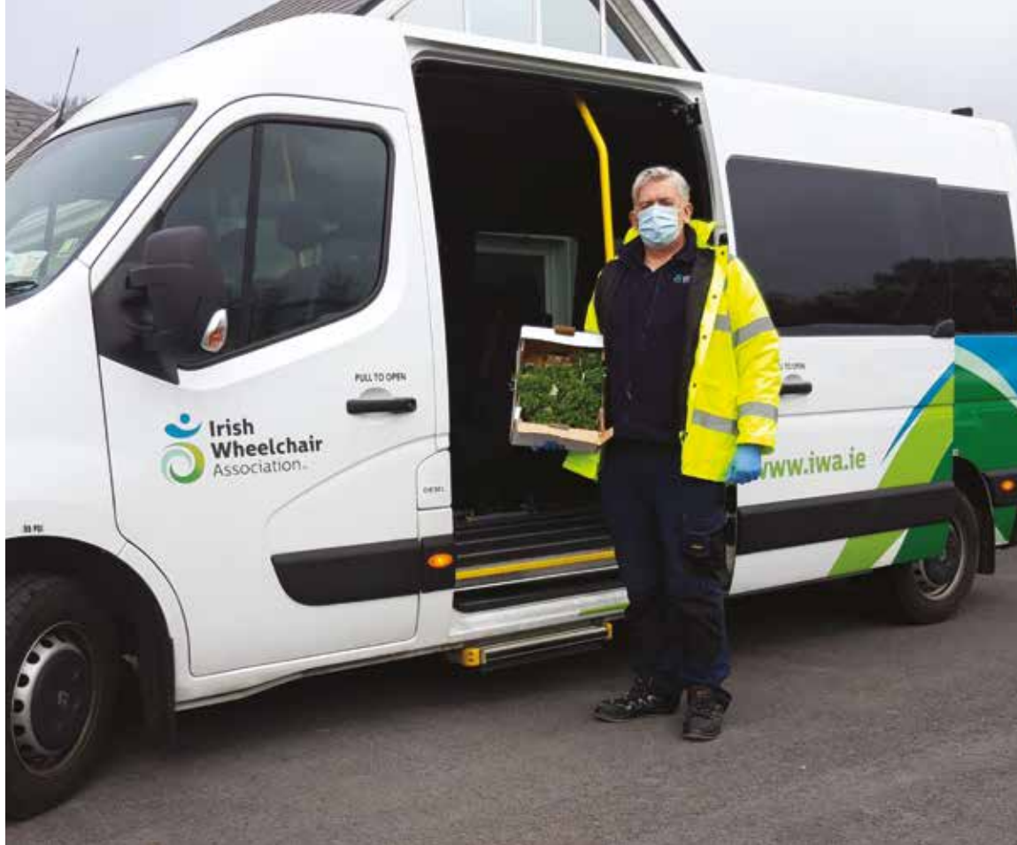
Photo Caption: Our fleet of 127 accessible buses work across our 59 community centres providing members with the freedom of access to their local community and fun outings.

MAATS stands for Motoring advice, assessment and tuition service which provides motorists with disabilities the opportunity to gain back some independence and freedom by learning or returning to driving.