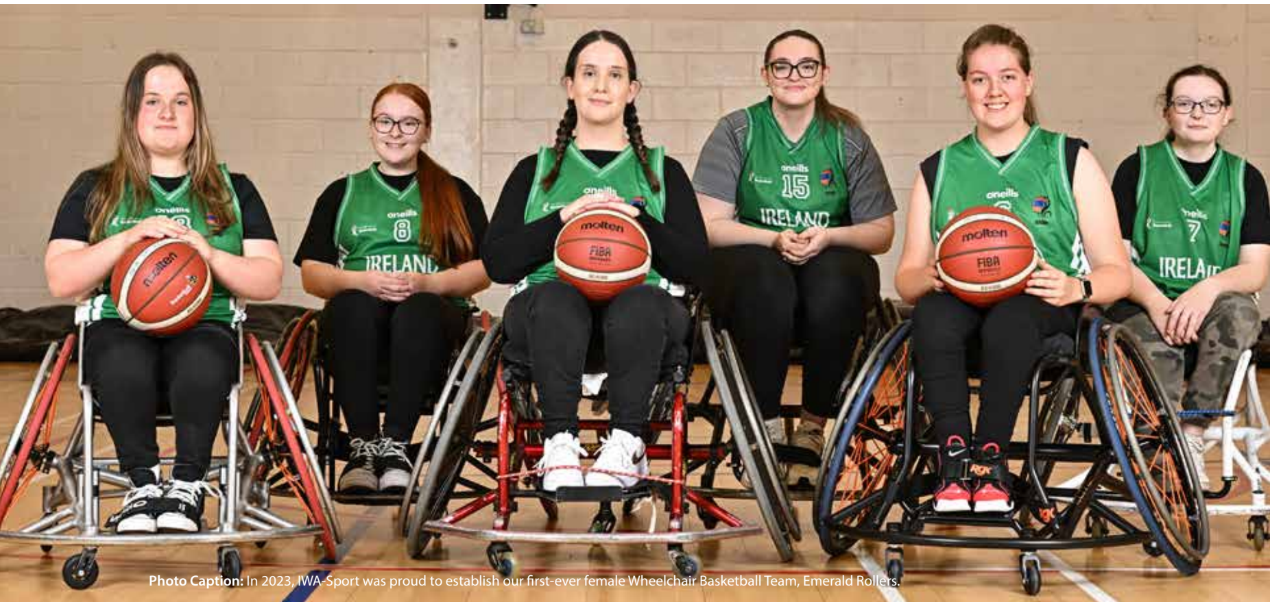
Photo Caption: In 2023, IWA-Sport was proud to establish our first-ever female Wheelchair Basketball Team, Emerald Rollers.

Our 19 clubs offer a range of sports including Wheelchair Basketball, Wheelchair Rugby, Para Powerlifting and Para Athletics. Junior clubs offer multi-sports which include soccer, boccia, swimming and table tennis in addition to the above sports, giving children from as young as 5 up to 15 years old the opportunity to learn and grow in a fun environment. Our goal is to encourage and support participation in sports for children and adults across all age groups and activity levels, whilst also supporting high-performance athletes nationally and internationally.