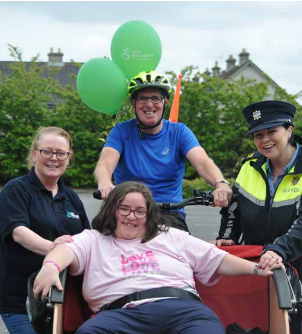
Photo Caption: IWA's person-centred approach enables people with disabilities to live an independent life full of choice in their own community.

Personal assistant services continue to be the heartbeat of the organisation as this supports people with physical disabilities to live independent lives, with choice, in their own homes. They also support with access to education, sport, employment and beyond.