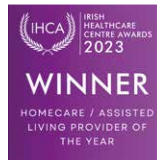
Photo Caption: IWA awarded Homecare Provider of the Year at the Irish Healthcare Awards for our Assisted Living Service.

In 2023, we delivered 1.3 million hours of Assisted Living Services for 2,231 people across Ireland.