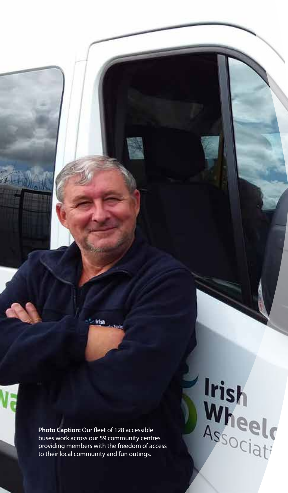
Photo Caption: Our fleet of 128 accessible buses work across our 59 community centres providing members with the freedom of access to their local community and fun outings.