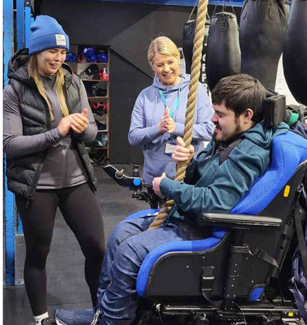
Photo Caption: The Inclusive Fitness Programme supports members to focus on their health by introducing them to a local gym and focusing on their ability.

The National School Leavers Service, an education programme for young adults from 18 years old upwards is growing from strength to strength. In 2023, 47 new school students entered this service which is offered in our centres in Balbriggan, Drogheda, Dundalk, Galway, Kilkenny, Longford, Mayo and Portlaoise.