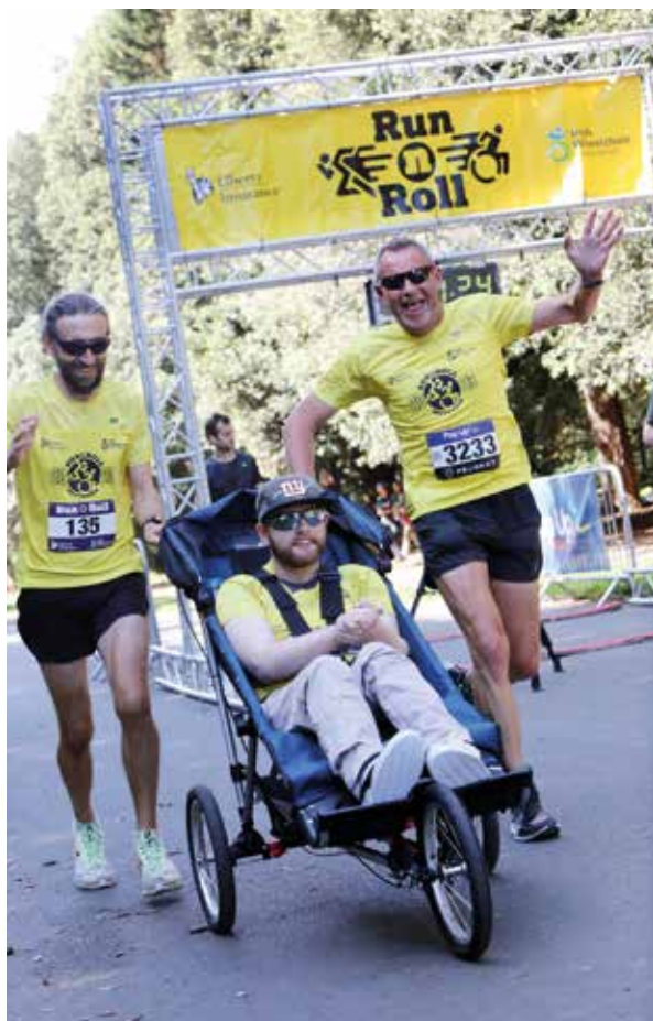
Photo Caption: The annual Liberty Insurance Run 'n' Roll fundraising event in St. Anne's Park, Clontarf is growing from strength to strength.