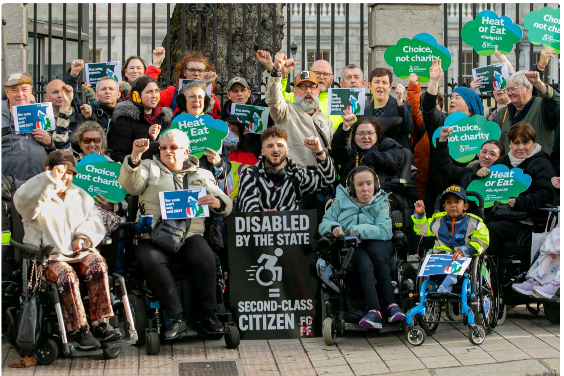
Some of the protesters who gathered outside Leinster House on Tuesday, seeking an Emergency Winter Payment.

The protest was organised after the government ignored weeks of criticism from people with disabilities, many of whom were forced to share their personal stories of struggle in a desperate plea for compassion and equality.