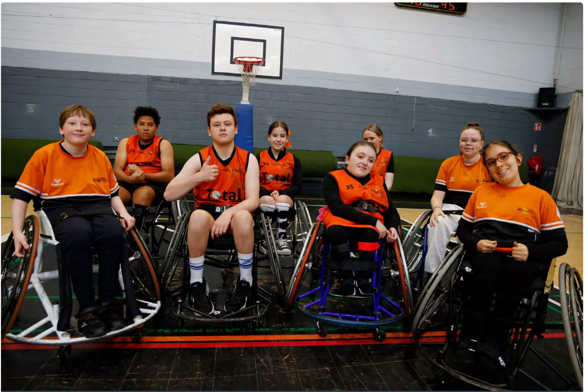
Members of Killester Tigers Junior Wheelchair Basketball Club pictured at a recent blitz