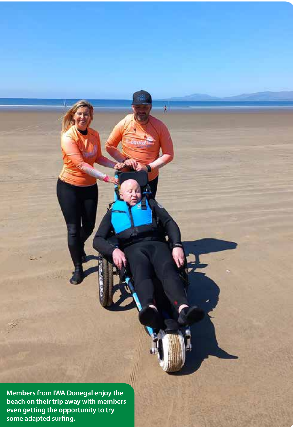
Members from IWA Donegal enjoy the beach on their trip away with members even getting the opportunity to try some adapted surfing.

In 2025, we provided 754 holiday breaks to members, equating to 2,819 bed nights.